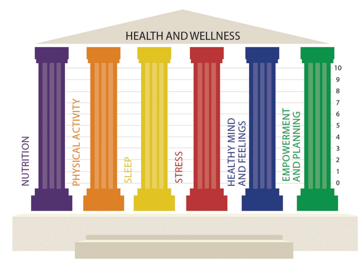
Chart each pillar from 0–10 to illustrate the degree to which your behavior in each area contributes to your health and wellness. Marking the pillar at 10 indicates a strong foundation of healthy habits in that area. Similarly, a pillar that is marked 0 depicts a weakness in your foundation. Knowing your current strengths and weaknesses will help you develop an effective wellness plan.